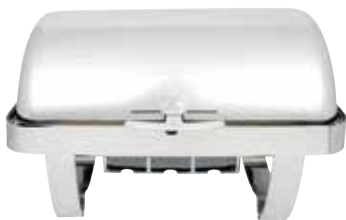
Classic Full Size Chafer K2509-6

8.4-14.8 qt./ 7.9-14.0 L 26.0"W x 18.9"D x 15.8"H See inserts next page *18/8 Stainless Steel